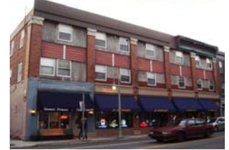
Before (above) and after of a Façade Improvement Project